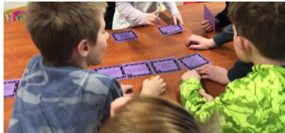
putting the preamble to the constitution in order